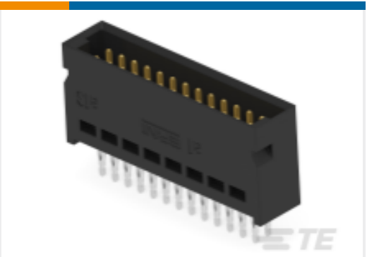
TE Part #064003-E SMCQ 26 M AB VV 3-04 * 2,8 0003 137 E001