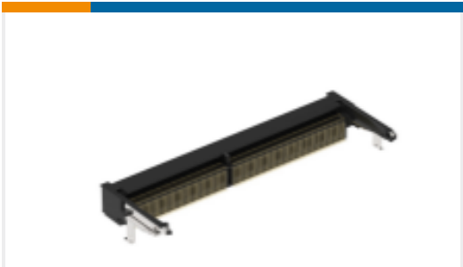
TE Part #2309413-1 DDR4 SODIMM 260P 9.2H STD