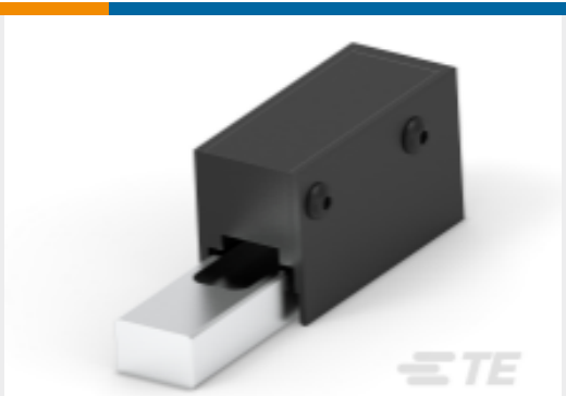
TE Part #2215077-4 ASSY, SEATING TOOL, SFP