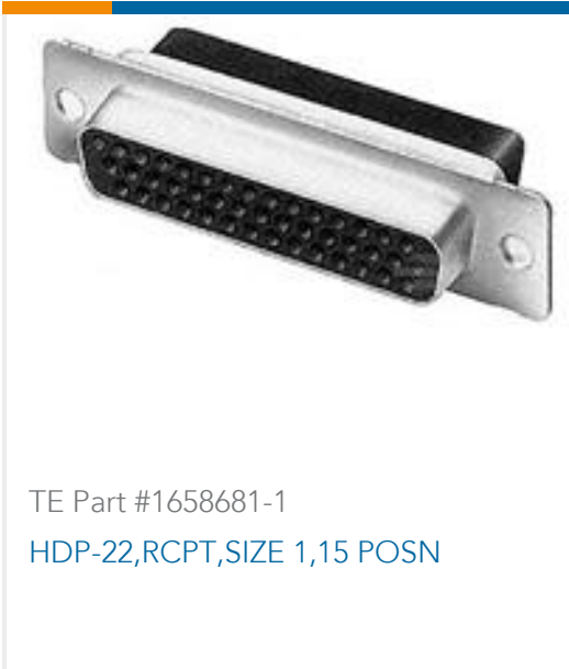
TE Part #1658681-1 HDP-22,RCPT,SIZE 1,15 POSN