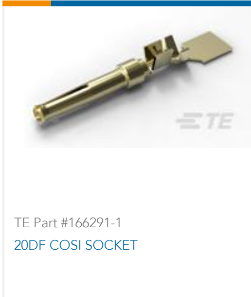
TE Part #166291-1 20DF COSI SOCKET