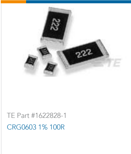
TE Part #1622828-1 CRG0603 1% 100R