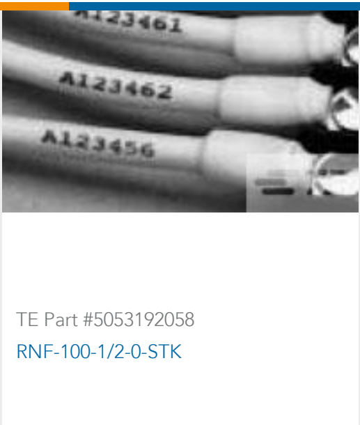
TE Part #5053192058 RNF-100-1/2-0-STK