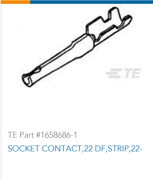
TE Part #1658686-1 SOCKET CONTACT,22 DF,STRIP,22-