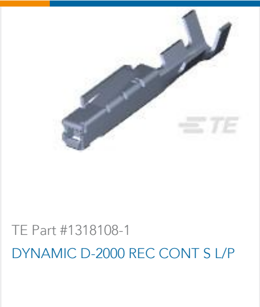
TE Part #1318108-1 DYNAMIC D-2000 REC CONT S L/P