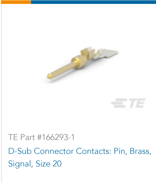
TE Part #166293-1 D-Sub Connector Contacts: Pin, Brass, Signal, Size 20