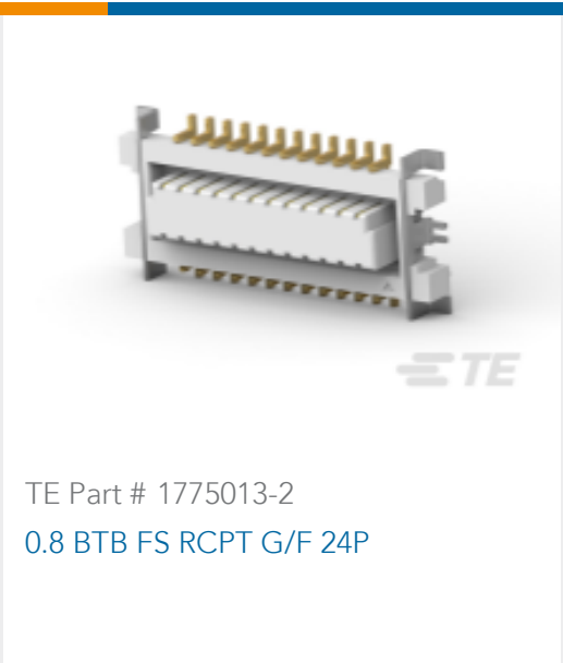
TE Part # 1775013-2 0.8 BTB FS RCPT G/F 24P