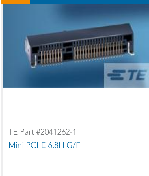
TE Part #2041262-1 Mini PCI-E 6.8H G/F