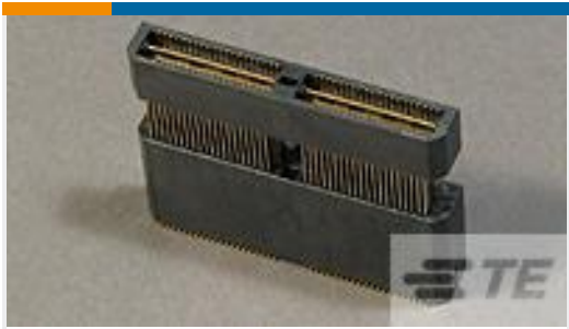
TE Part # 1658020-2 MSB0.80PL30ASY080FL,-,10,-TY