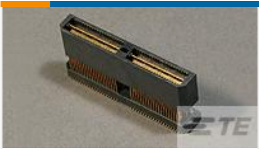
TE Part # 1658048-2 MSB0.80PL19ASY080FL,-,F,-TY