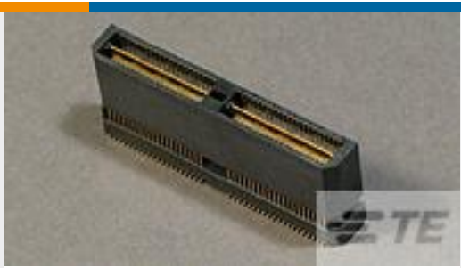
TE Part # 1658047-2 MSB0.80PL16ASY080FL,-,F,-TY