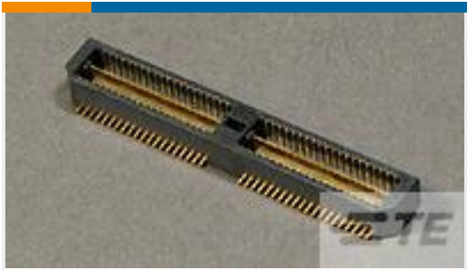
TE Part # 1658044-2 MSB0.80PL5ASY080FL,-,F,-TY