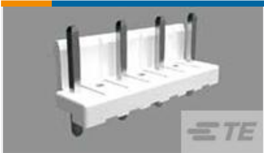
TE Part #1-1318301-2 3.96EP HDR ASSY 2(3)P NAT/TUBE