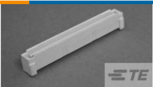
TE Part #3-5177986-1 0.8FH,P08H.5,040,08/Sn,TR,SC