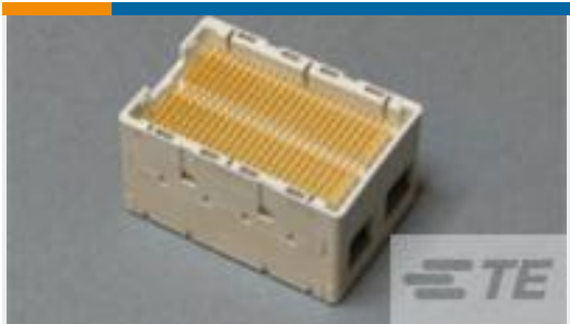
TE Part # 7-1761616-0 STEP-Z PLUG 20MM 296P LF ST