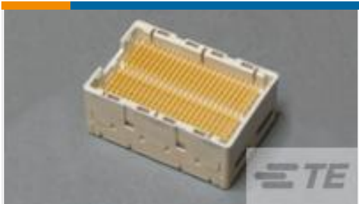
TE Part # 6-1761616-5 STEP-Z PLUG 15MM 296P LF ST