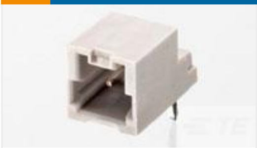
TE Part #292206-8 MINI CT SGL DIP H 8P NAT