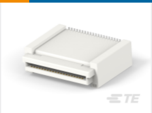
TE Part #2271041-1 0.8FH,R19H.5,040,30/SN,TR,SC