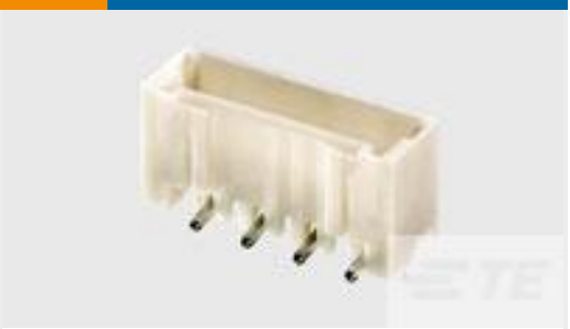
TE Part #292231-4 1.5 MINI CT SGL V SMT W/O BOSS