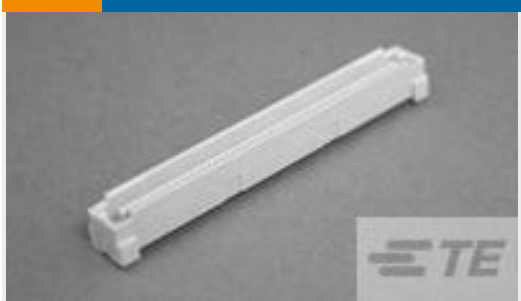
TE Part # 5179029-1 0.8FH,P06H.5,040,08/Sn,TU