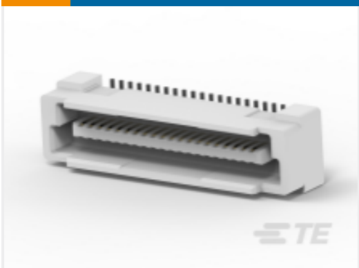
TE Part #5177986-1 Free Height Plug Connector: Board-Board, Vertical, 40, 0.8mm