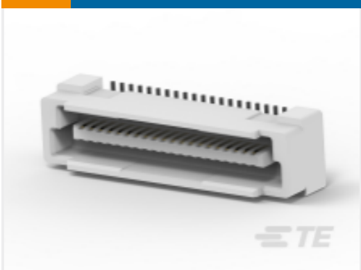
TE Part # CAT-313-PCB40 Free Height Plug Connector: Board-Board, Vertical, 40, 0.8mm

EU RoHS compliant have a maximum concentration of 0.1% by weight in homogenous materials for lead, hexavalent chromium, mercury, PBB, PBDE, DBP, BBP, DEHP, DIBP, and 0.01% for cadmium, or qualify for an exemption to these limits as defined in the Annexes of Directive 2011/65/EU (RoHS2). Finished electrical and electronic equipment products will be CE marked as required by Directive 2011/65/EU. Components may not be CE marked. Additionally, the part numbers that TE has identified as EU ELV compliant have a maximum concentration of 0.1% by weight in homogenous materials for lead, hexavalent chromium, and mercury, and 0.01% for cadmium, or qualify for an exemption to these limits as defined in the Annexes of Directive 2000/53/EC (ELV). Regarding the REACH Regulation, the information TE provides on SVHC in articles for this part number is based on the latest European Chemicals Agency (ECHA) ‘Guidance on requirements for substances in articles’ posted at this URL: https://echa.europa.eu/guidance-documents/guidance-on-reach