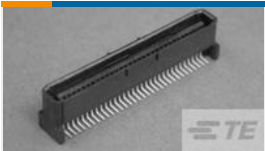
TE Part #5120527-1 1FHP,64,30A/S,S,N,S10,12,13,15