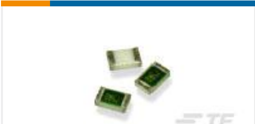
TE Part #1614881-8 CPF0603 15K 0.1% 25PPM 1K RL