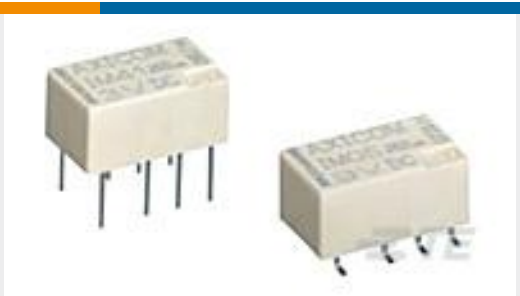
TE Part #1462037-9 IM02GR=IM RELAY 140mW 4.5V