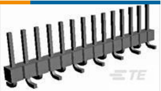
TE Part #1241150-3 3P MOD II BREAK AWAY HDR,SMD, BLISTER