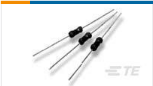
TE Part #5-1625885-1 1W SM M/OX 5% 27K