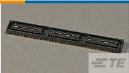
TE Part #7-1658012-3 MSB0.80RC-ASY84DP,-,10,VCTR