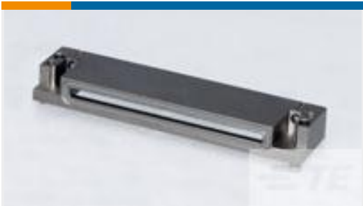
TE Part #2057631-1 CFP Receptacle Cover Assy