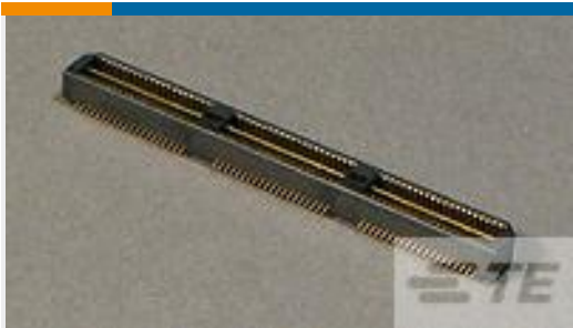
TE Part #7-1658013-3 MSB0.80PL5ASY84DP,GP,10,VCTR