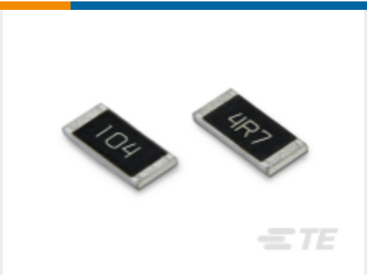
TE Part #4-2176455-9 CPF 0402 348K 0.1% 25ppm 1K RL