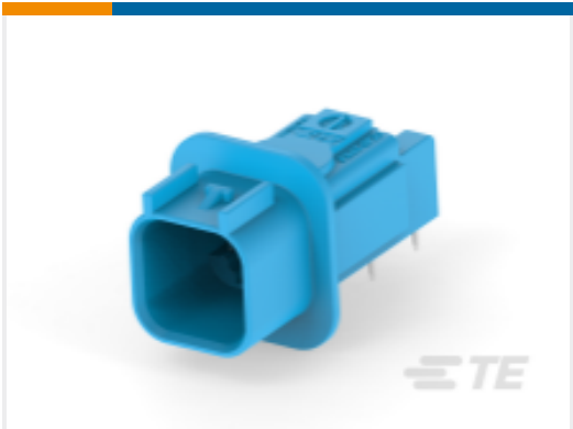
TE Part #1802162-3 1-PORT MATENET HDR 90DEG SEALED, COD C