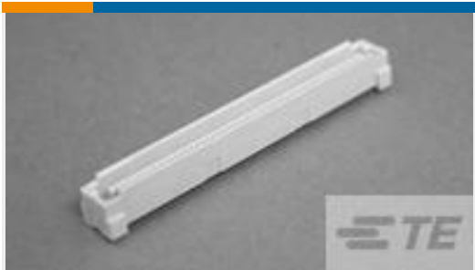
TE Part #1-5177986-1 0.8FH,P06H.5,040,08/Sn,TR,SC