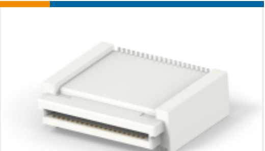
TE Part #2271041-1 0.8FH,R19H.5,040,30/SN,TR,SC