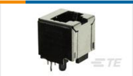
TE Part #6116202-1 MJ,TE,8P,COMPL.PIN,CAT5,PC