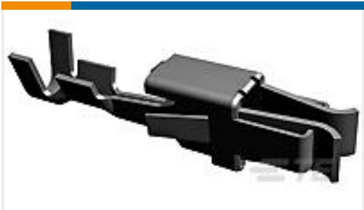
TE Part #965899-1 JPT REC 2.8 Contact SRC Sn