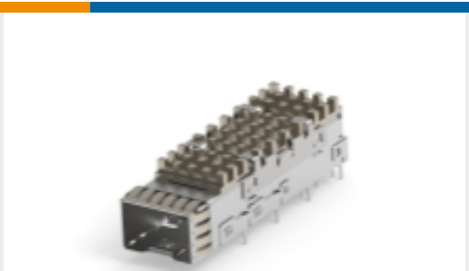
TE Part #2324719-1 SFP+ 1X1 CAGE ASSEMBLY, PCI, HS