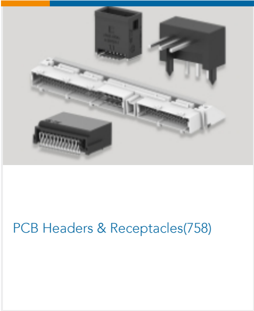
PCB Headers & Receptacles(758)