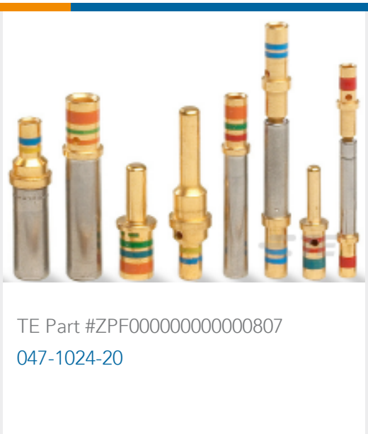
TE Part #ZPF0000000000000807 047-1024-20