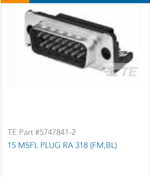
TE Part #5747841-2 15 MSFL PLUG RA 318 (FM,BL)