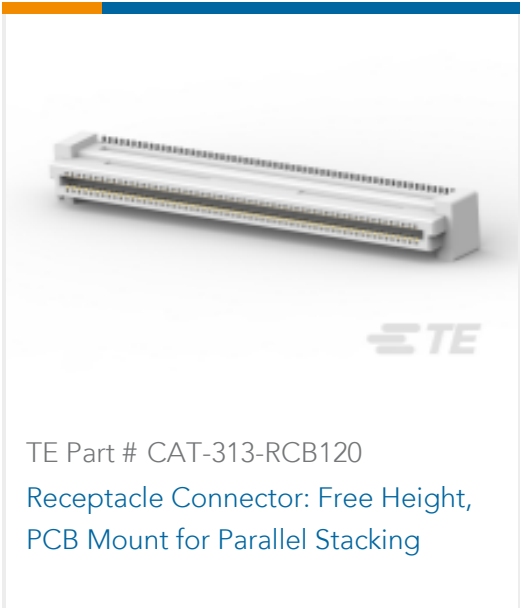
TE Part # CAT-313-RCB120 Receptacle Connector: Free Height, PCB Mount for Parallel Stacking