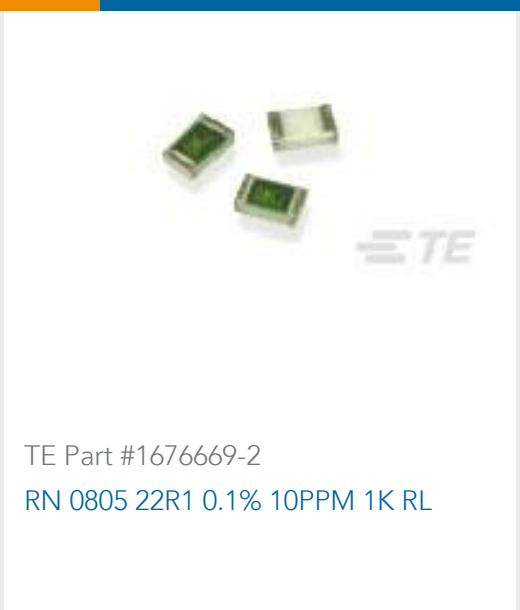
TE Part #1676669-2 RN 0805 22R1 0.1% 10PPM 1K RL