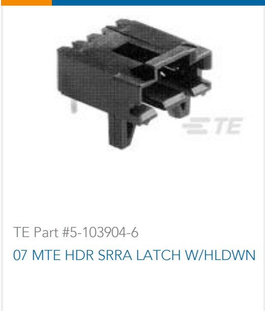
TE Part #5-103904-6 07 MTE HDR SRRA LATCH W/HLDWN