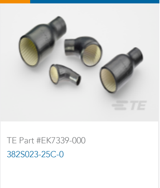
TE Part #EK7339-000 382S023-25C-0