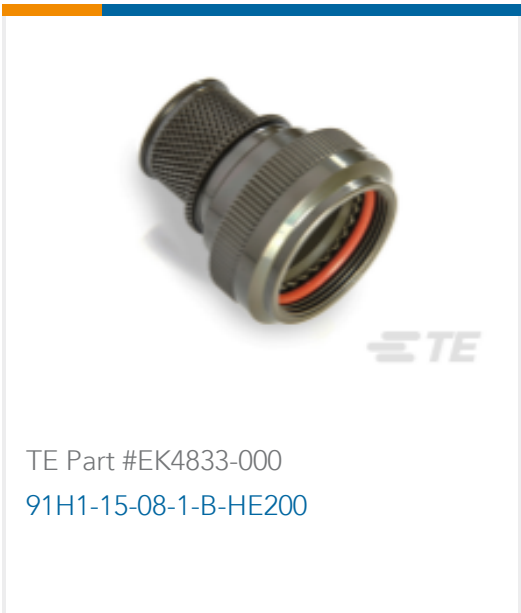
TE Part #EK4833-000 91H1-15-08-1-B-HE200