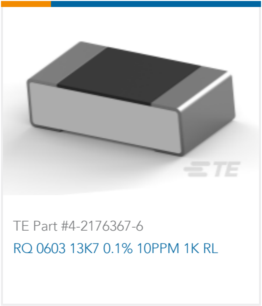
TE Part #4-2176367-6 RQ 0603 13K7 0.1% 10PPM 1K RL