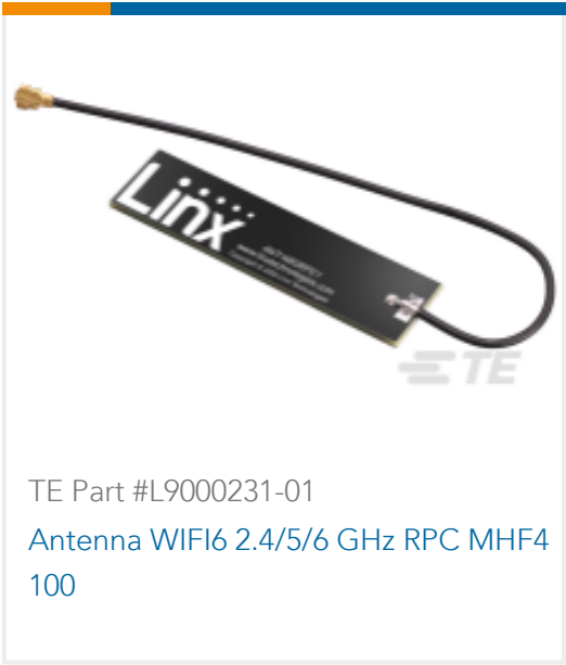
TE Part #L9000231-01 Antenna WiFi6 2.4/5/6 GHz RPC MHF4 100