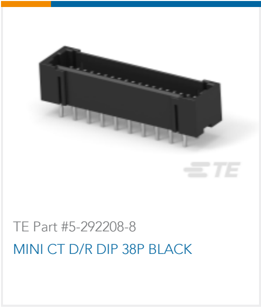
TE Part #5-292208-8 MINI CT D/R DIP 38P BLACK