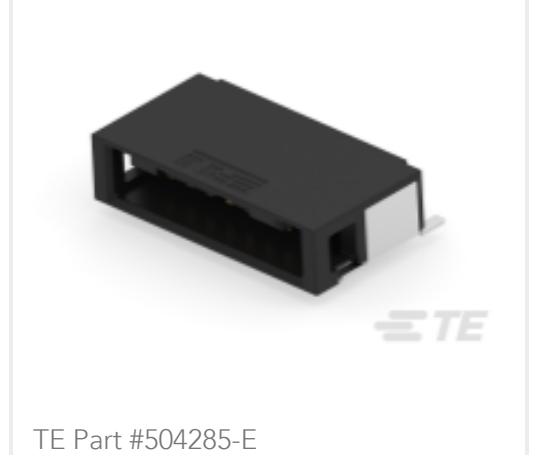
TE Part #504285-E MCBA 8 M * SMD 137 * 176 * GURT * J 2 50