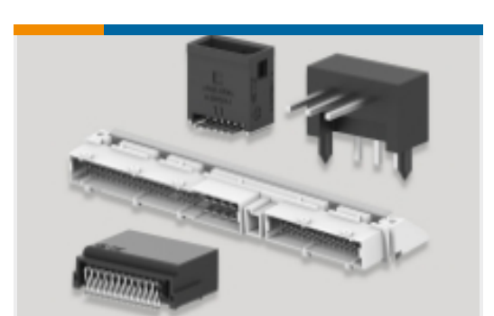
PCB Headers & Receptacles(1)