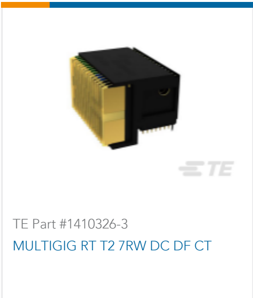
TE Part #1410326-3 MULTIGIG RT T2 7RW DC DF CT