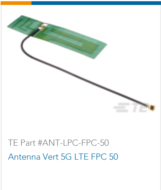
TE Part #ANT-LPC-FPC-50 Antenna Vert 5G LTE FPC 50