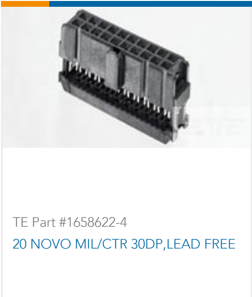
TE Part #1658622-4 20 NOVO MIL/CTR 30DP,LEAD FREE