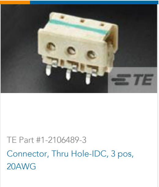
TE Part #1-2106489-3 Connector, Thru Hole-IDC, 3 pos, 20AWG