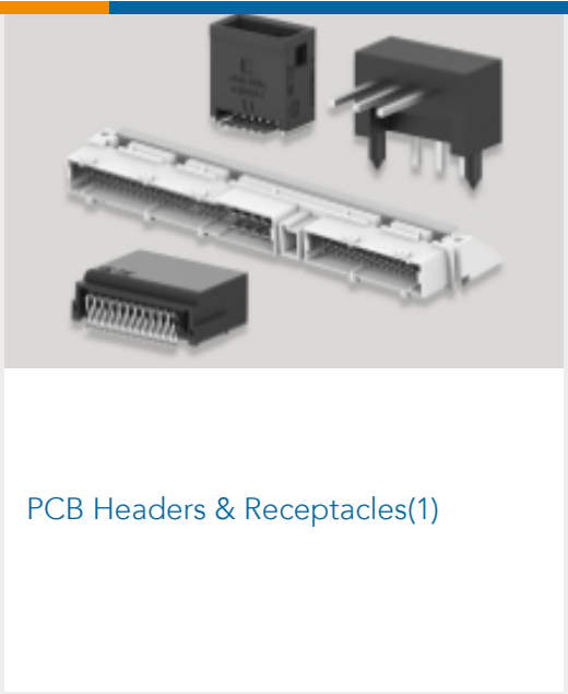
PCB Headers & Receptacles(1)