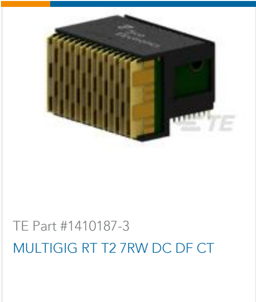
TE Part #1410187-3 MULTIGIG RT T2 7RW DC DF CT