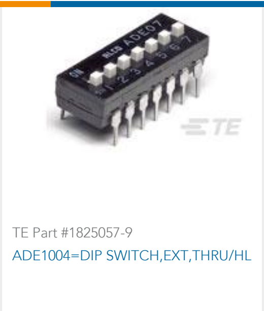
TE Part #1825057-9 ADE1004=DIP SWITCH,EXT,THRU/HL