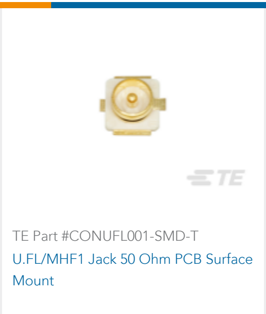
TE Part #CONUFL001-SMD-T U.FL/MHF1 Jack 50 Ohm PCB Surface Mount