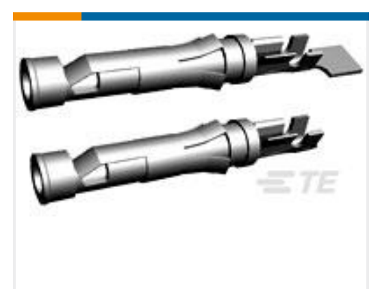
TE Part #66360-1 III+ SKT,18-14,30AU>10,LP