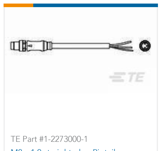
M8 x 1.0 straight plug Pigtail