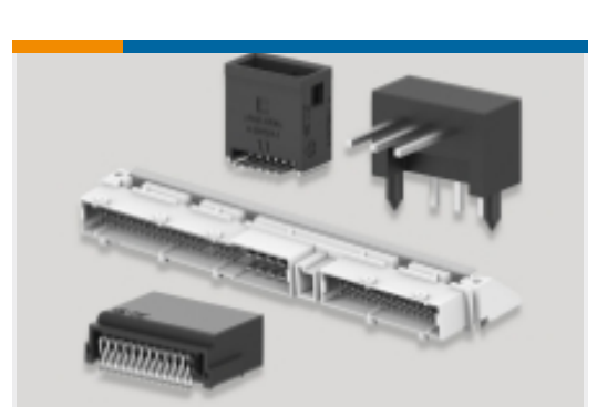
PCB Headers & Receptacles(1)