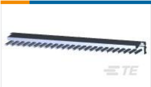
TE Part #2-640445-4 24P MTA156 HDR ASSY FL/STR SN