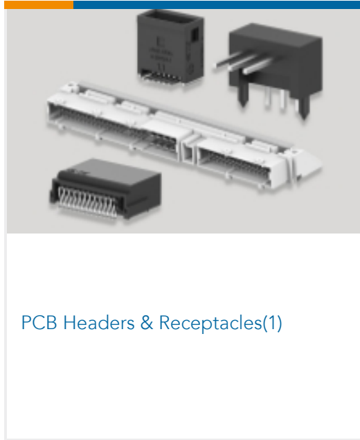
PCB Headers & Receptacles(1)