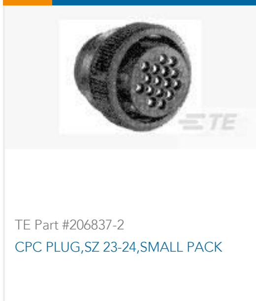
TE Part #206837-2 CPC PLUG,SZ 23-24,SMALL PACK