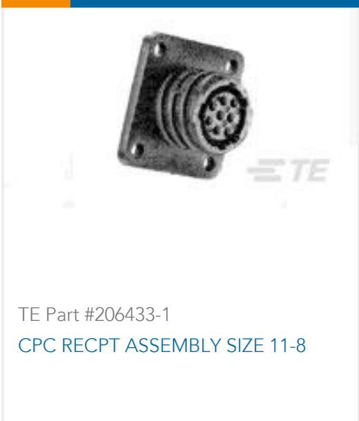
TE Part #206433-1 CPC RECEPT ASSEMBLY SIZE 11-8