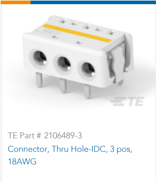
TE Part # 2106489-3 Connector, Thru Hole-IDC, 3 pos, 18AWG