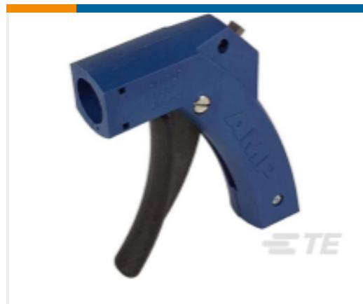
TE Part # 58074-1 MTA 50/100/156 MANUAL TOOL FRAME