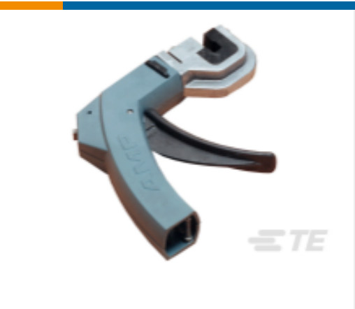
TE Part # 58372-1 HEAD (IDC) 2MM C.T. W/O TL