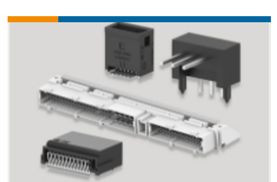
PCB Headers & Receptacles(1)