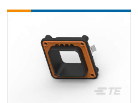
TE Part #DRBF-2A FLANGE, MOUNT, 60/48P, BLK, A