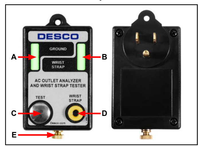
Figure 3. 98133 AC Outlet Analyzer and Wrist Strap Tester features and components