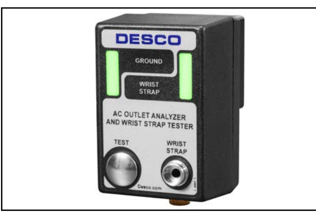
Figure 2. Desco 98134 AC Outlet Analyzer and Wrist Strap Tester