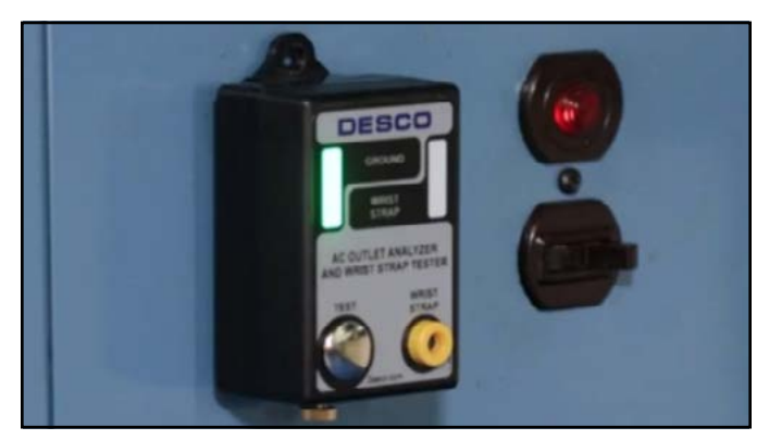
Figure 5. Verifying a properly wired AC outlet

The Ground LED will illuminate red and the audible alarm will sound if the outlet's wiring is incorrect or the path to equipment ground via the equipment grounding conductor is not intact.