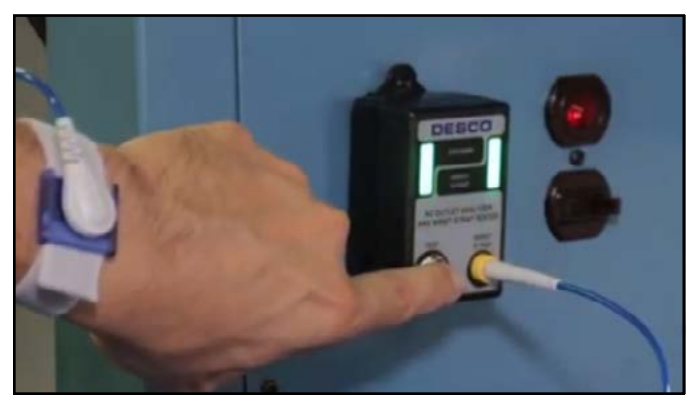
Figure 7. Performing a wrist strap test

If the test fails, check the wrist strap to ensure it is being worn correctly and/or needs to be replaced. Failures may also be caused by dry skin or minimal sweat layer. Apply an approved dissipative hand lotion such as Menda Reztore® ESD Hand Lotion to the wrist prior to use.