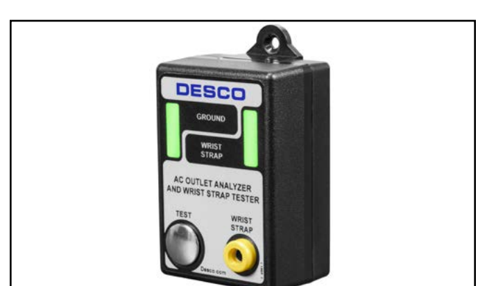
Figure 1. Desco 98133 AC Outlet Analyzer and Wrist Strap Tester