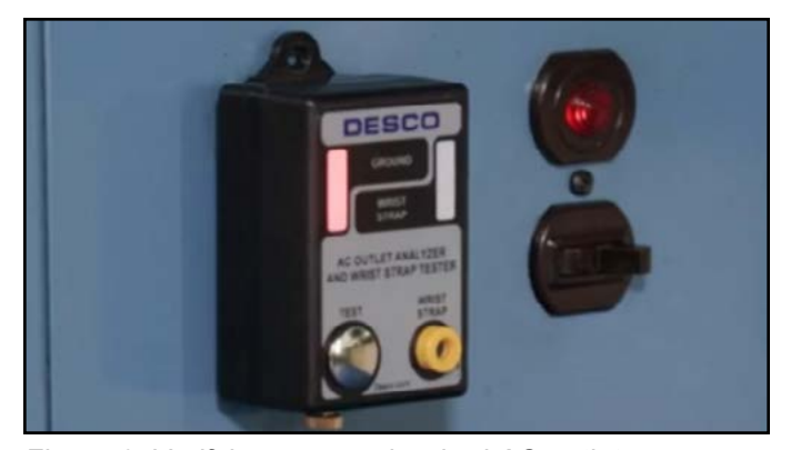
Figure 6. Verifying a properly wired AC outlet

The Ground LED will illuminate red and the audible alarm will sound if the outlet's wiring is incorrect or the path to equipment ground via the equipment grounding conductor is not intact.